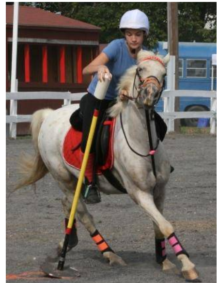
C Pellet Blue Ridge Games

This new venue also made socializing a top evening priority. Many participants camped out and took part in an evening potluck dinner followed by marshmallow roasting around a camp fire.