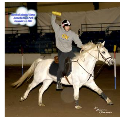
J MCCready Snowball 2007

Dec. 13 – 14, 2008 (closing date 12/2/08), Jan. 3 – 4, 2009 (closing date 12/23/08), Feb. 7 – 8, 2009 (closing date 1/27/09)