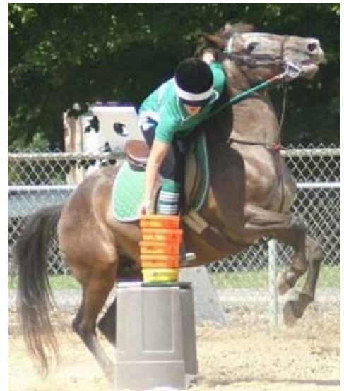
MA#3