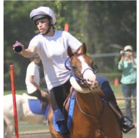
J Emblem MA#3

6] Proposal for Games Exhibition at the 2010 World Equestrian Games – The BOG authorized a proposal to conduct a games exhibition at the 2010 World Equestrian Games. We are waiting to see if our proposal has been accepted.