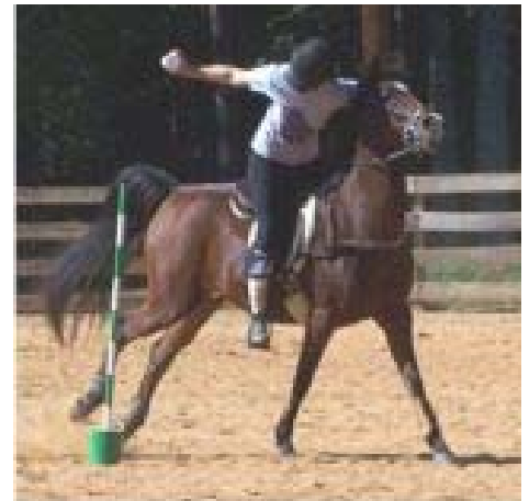
I Canton Southern Comfort