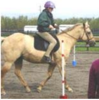
R. Saar NW Clinic