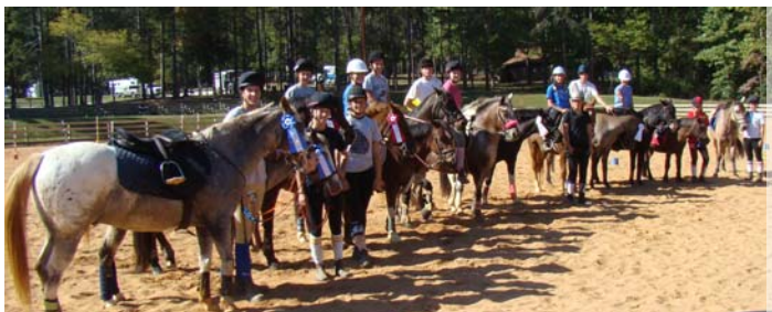
Southern Comfort Advanced Riders

took her pony swimming in the lake on Sunday after the competitions were over!