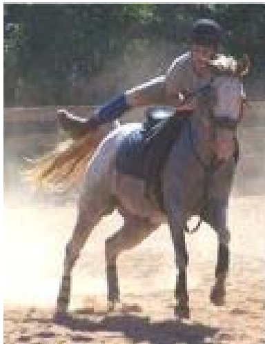
D Sargent Southern Comfort

If you ever want a back copy of the Galloping Gazette or you wish to see it in color you can find easily printable versions on the MGAA Yahoo group site under Files or on www.MountedGames.org website.