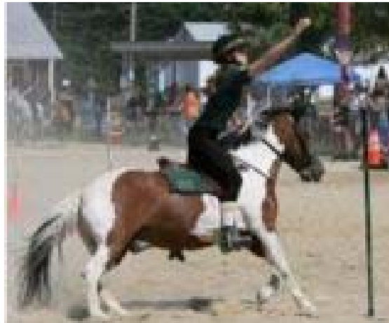
K Hellhak MA#3

The indoor has an observation area and some stalls will be available for overnight stay. Contact Michelle Reilly for more information at 301-432-2009 or reillymichelle60@hotmail.com