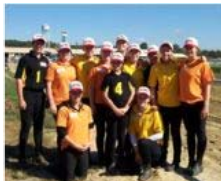
Md Million Teams

Timing was everything. We had to work between television spots, race objections, the horses coming out on the track for the next race, and the watering & harrowing of the track. The teams were ready and at their signal, they came down the track and lined up. Line A was the actual Finish line of the Laurel Park track for the first session. The whistle blew and the flag was dropped simultaneously and the games began. Due to a horse coming on the track late, we were only able to ride three races for the first session, but the crowd quickly got into it and was cheering on the teams. Bending came and went in a flash and riders 2 and 4 quickly galloped to the C line so Mug Shuffle could begin. Riders again rushed to get ready for Carton and as soon as the last rider crossed the finish line, the riders were ordered immediately off the track. They were able to gallop down the track in front of the grandstands with the crowd really cheering them on.